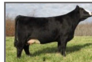
Higher Hope - cow family

LLSF Vantage Point F398 DAM: 6/R WBS Special Effect J135 6/R WBS Harmony F136