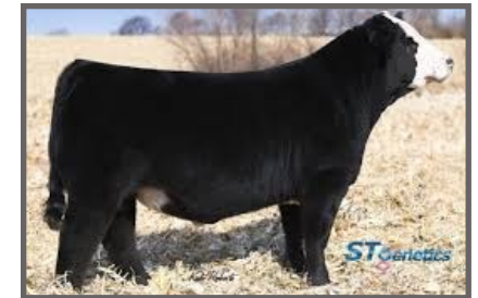
Maternal Sire - Hitman

DMCC Hitman 116G DAM: SS Jules 21K SS Sweety