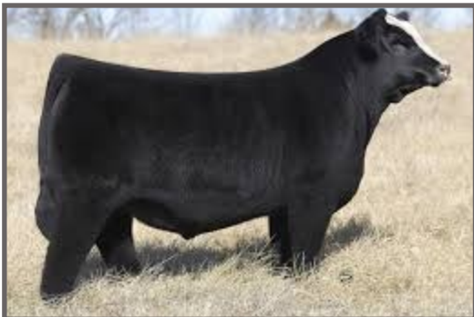
LLSF Draft Pick - sire