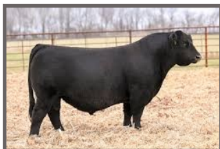
Family Tradition - sire

WLE Uno Mas X549 DAM: SS Hailey SS Stormy