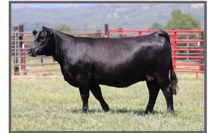
Dam - Alley 124J

Mr CCF Clarified DAM: CNS/HFS/102 Alley 124J B&K Alley 124E