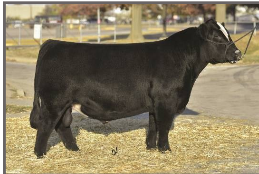
HPF/HILL Uprising "Saban" - sire