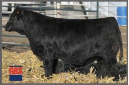
TJ Gold - service sire

MR NLC Upgrade U8676 DAM: Sweetie Gal C14 GBCC Rubys Magnetic 510R