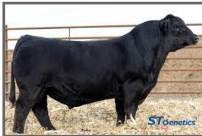
Sire - Epic

WLE Uno Mas X549 DAM: SS Sundaze SS Lola