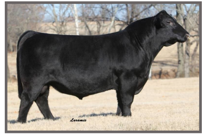
Copacetic - sire

CCR Wide Range 9005A DAM: SS Diamond SS Opal