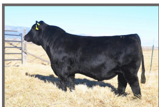
Lover Boy - sire

HILB Oracle C033R DAM: SS Phoebe 22K SS Jessie