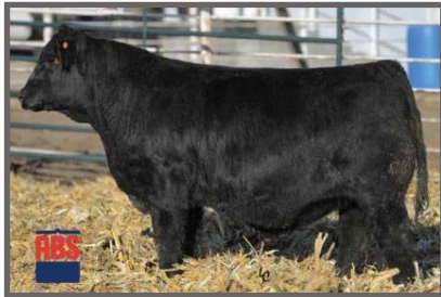
Sire - Gold

Yardley Utah Y361 DAM: SS Birdie 4K SS Liberty