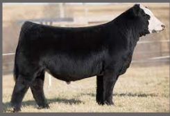
On The Mark

SIRE: JASS On The Mark DAM: Commercial Angus OPENING BID: $2200